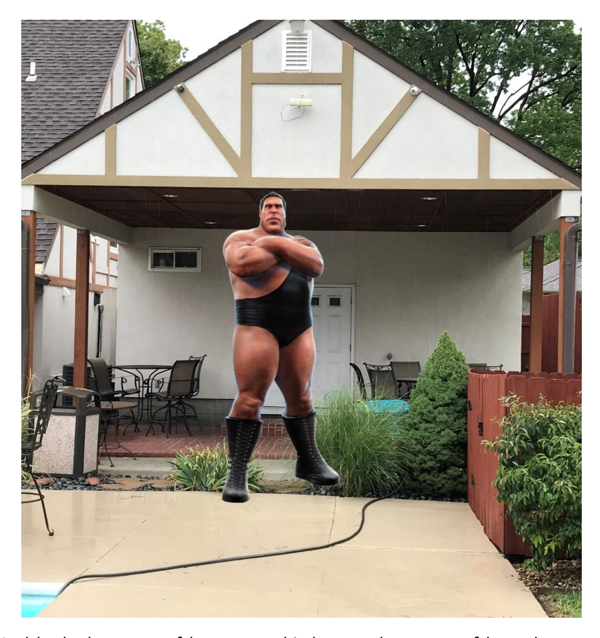
6 And he had greaves of brass upon his legs, and a target of brass between his shoulders.

Strong's translates "greaves of brass" as leg armor. Some say that because Goliath's legs were within reach of the ordinary man, they were the most vulnerable to attack. Clarke says it was a plate of brass which covered the shin or fore part of the leg, from the knee down to the instep, and was buckled with straps behind the leg. This would have been the military equivalent to shin guards in soccer, but made out of brass.